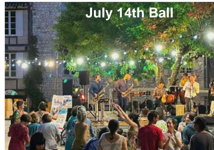
Monflanquin, a festive, family-friendly and gourmet town