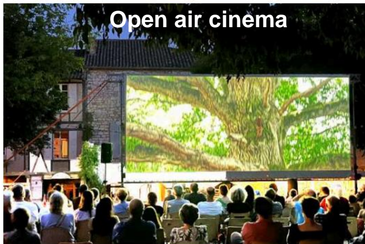
Monflanquin, a sporty bastide