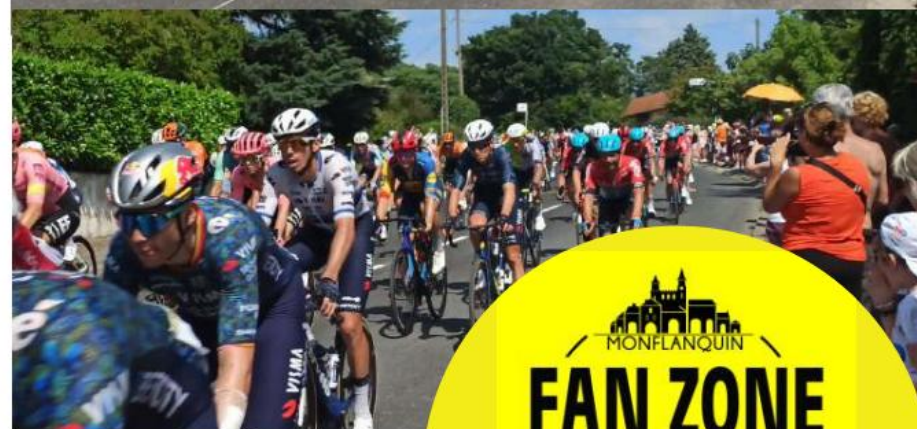
Tour de France July 11, 2024