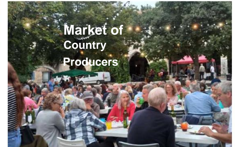
Monflanquin, a fortified town that has stood the test of time and is open to the world