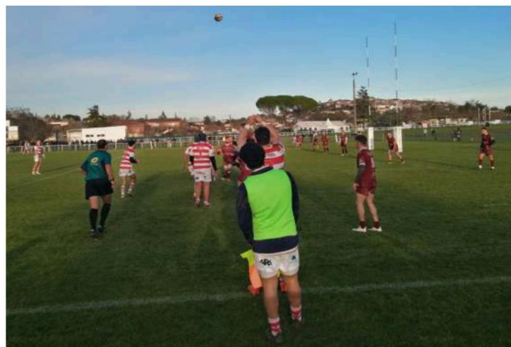
St André 2023, the 4 Cantons win against Bourges