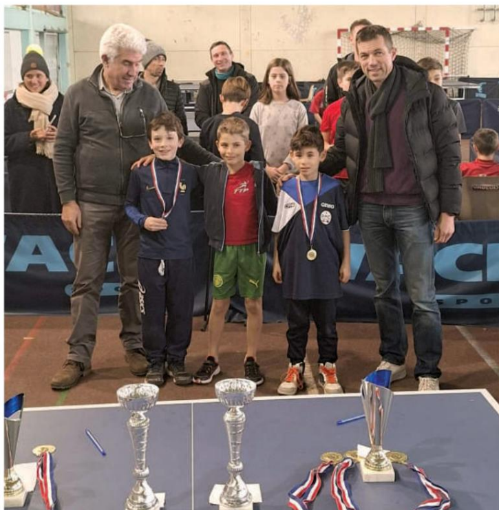
Youth tournament - December 11, 2023

The very humid weather since mid-October has abnormally disrupted training and outdoor competitions.