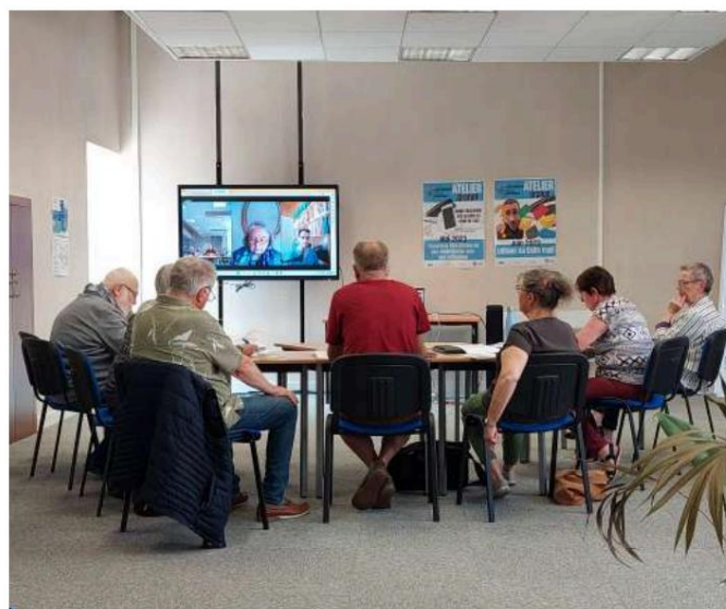
👁 Digital space