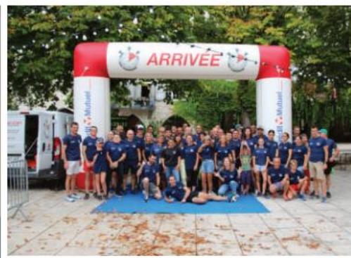
Urban Trail Monflanquin podium of the Foulées Monflanquinoises. © L. DAROT