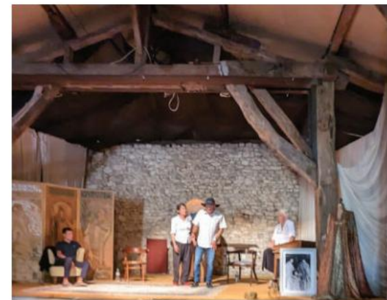
Rehearsal of the piece " Sarah BERNHARDT"