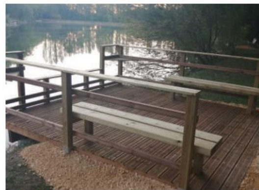
Fishing pontoon built by Technical Services as part of the "Family Journey" label