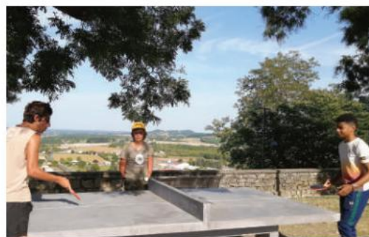
Ping-pong table on the Cap del square Pech