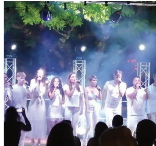
Head full of songs 2023