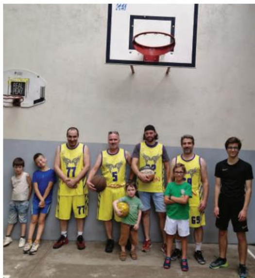
MJC open day July 3 - Leisure basketball