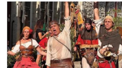
The Marouffes of the Sonjévèyes Company Medieval Festivals 2023