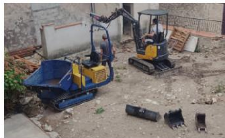
Renovation of the town hall courtyard. Work in progress