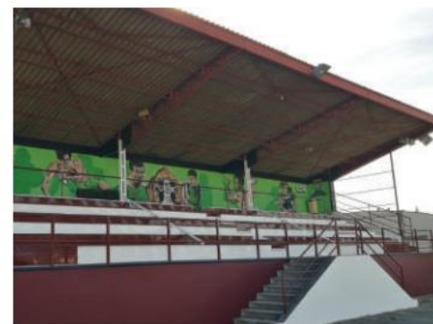
Painting of the stands of the Coulon stadium © L. DAROT