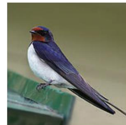
Hirundo rustica