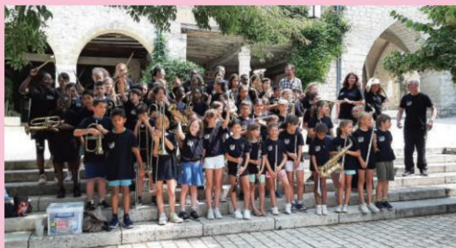
ÿ Orchestra at the Bègles school