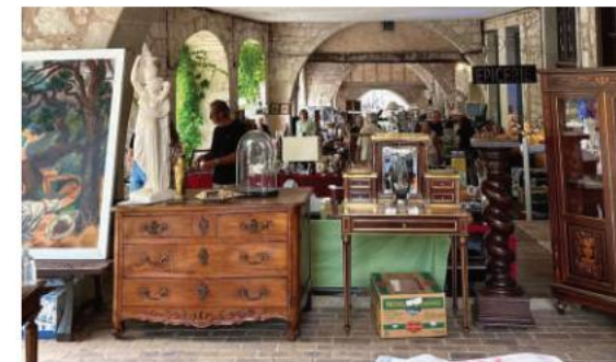
Antiques Flea market 46th Antiques Fair on July 16 and 17, 2023.