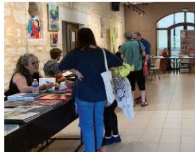
Book Fair