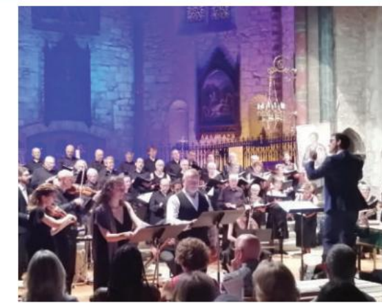
Baroque Evenings