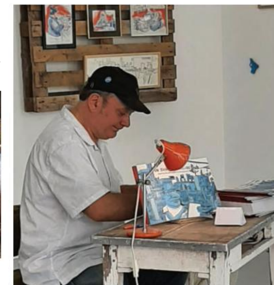
Exhibition of Laurent LOLMÈDE at Pollen, more than 700 visitors this summer and for heritage days, September 16 and 17, 2023, in connection with the media library, presence of the artist.