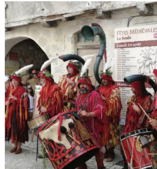
La Cie Saboi - Medieval Festivals 2023