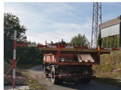
Installation in progress of a gantry at the Coulon stadium