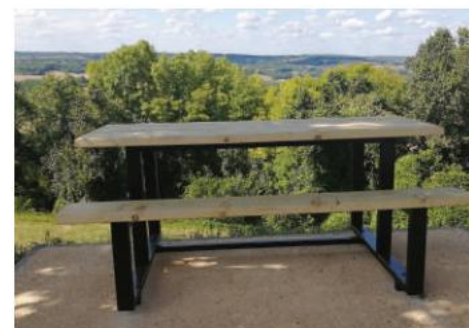
2 new tables manufactured by the technical services were put into service during the city tour at the beginning of the summer