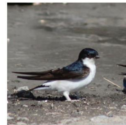
Delichon urbicum