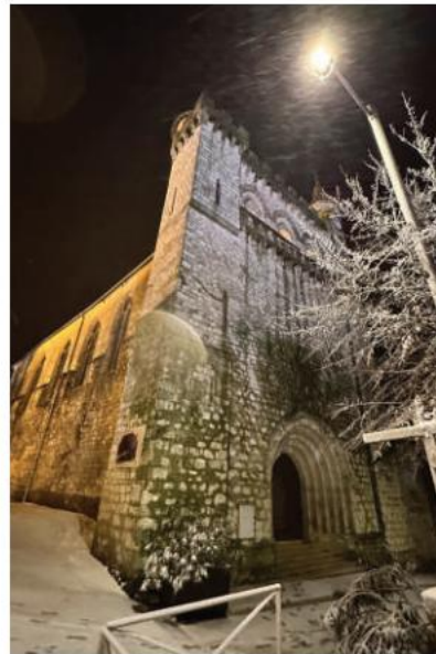
Monflanquin under the snow. January 2023